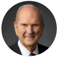
By President Russell M. Nelson