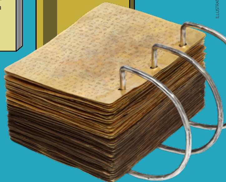
ILLUSTRATION OF JOSEPH SMITH AND ANGEL MORONI BY BRYAN BEACH