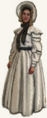
Lucy Mack Smith