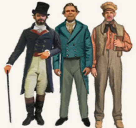
The Three Witnesses Martin Harris David Whitmer Oliver Cowdery