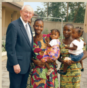
Clockwise from top: President Hinckley at the Boston Massachusetts Temple; interacting with the news media; with members in Ghana.