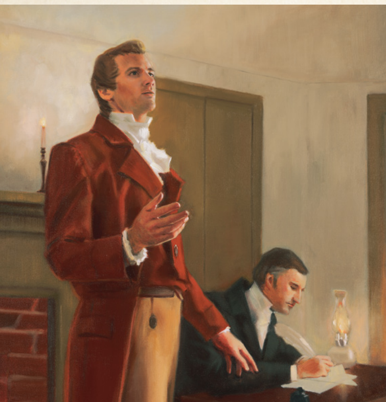
Joseph Smith received many revelations from the Savior.

D&C 18:33–35 “I, Jesus Christ, your Lord and your God, have spoken it. These words are not of men . . . , but of me; . . . it is my voice which speaketh them unto you.”