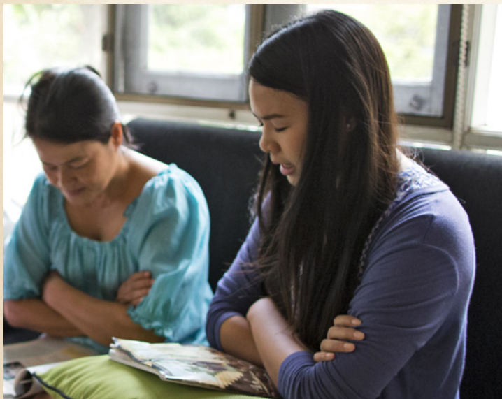
Study and prayer can unlock spiritual knowledge.

D&C 88:118 Seek learning by study and by faith.