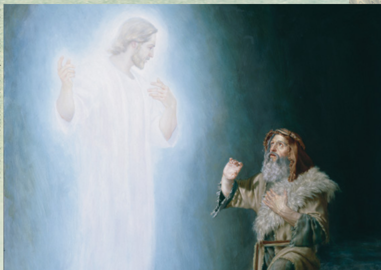
Jehovah (Jesus Christ) spoke to Moses face to face.