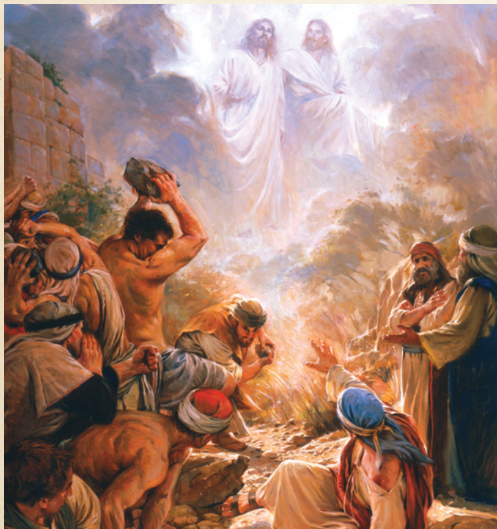
While being stoned to death, Stephen saw the Father and the Son.

D&C 138:3–4 Heavenly Father loves His children, so He sent His Son to save mankind.