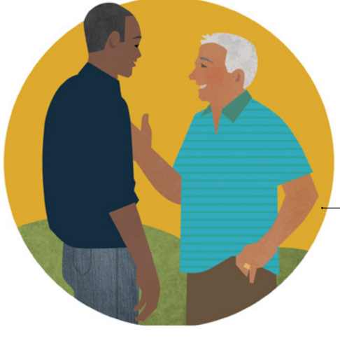
We can help spread the gospel by simply talking to people about it.