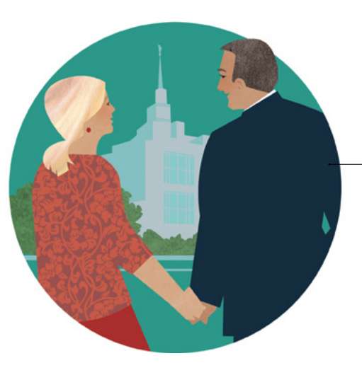
In the temple we can perform ordinances for those who died without hearing the gospel in this life.