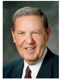
By Elder Jeffrey R. Holland Of the Quorum of the Twelve Apostles