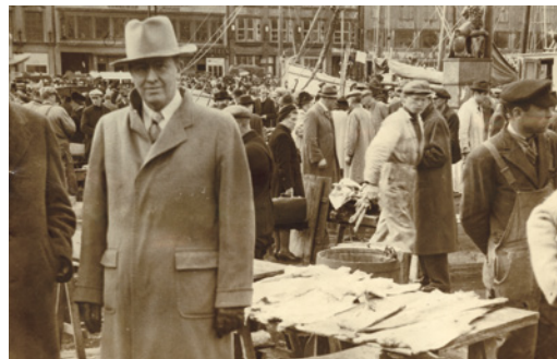
Top: Young Ezra Taft Benson, before receiving a mission call. Above and right: As an Apostle he helped serve the people in post-World War II Europe.