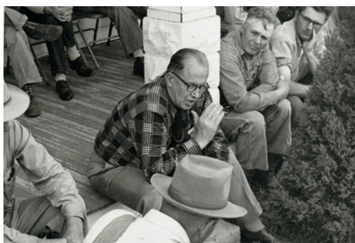
Top: President Benson among the Saints. Left and above: Serving as United States secretary of agriculture.

couple left immediately in their Model T Ford pickup truck for Ames, Iowa,” where Ezra would pursue a master’s degree in agricultural economics. “Along the way, they spent eight nights in a leaky tent. When they arrived in Ames, they rented an apartment one block from the college campus. The apartment was small, and the Bensons shared the space with a large family of cockroaches, but Ezra said that ‘it soon looked like the coziest little cottage one could ever imagine.’” 9