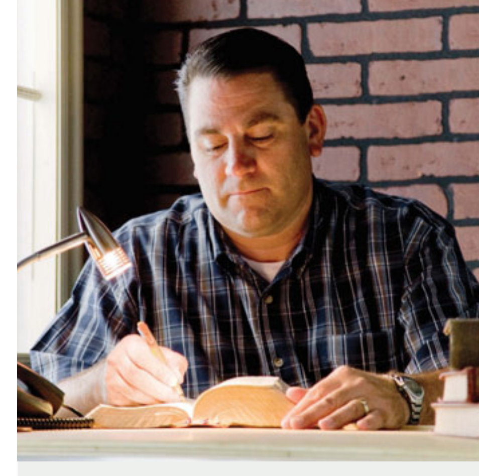
As we seek the Lord ever more diligently, we will surely find Him. Our eyes will be opened, and we will see Him open the windows of heaven and shower us with more of His light.

If ever you are tempted to become discouraged or to lose faith, remember those faithful Saints who remained true in Kirtland. Hold on a little longer. You can do this! You are part of a special generation. You were prepared and preserved to live at this important time in the