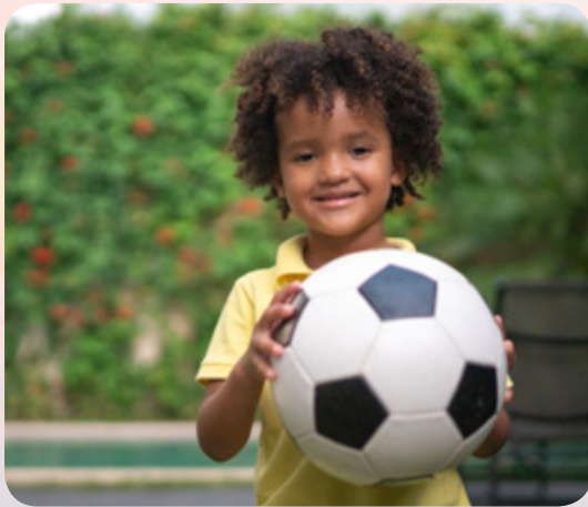
Football is the most popular sport in Brazil.

The Amazon River is the longest river in the world. And the Amazon rainforest is the biggest in the world! It's home to many amazing animals.