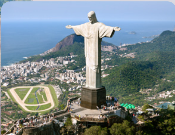
A giant statue of Jesus Christ stands on a mountaintop near the city of Rio de Janeiro.