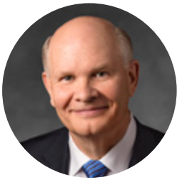
By Elder Dale G. Renlund