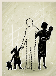
On the Cover Bereavement—Missing Father from a Family