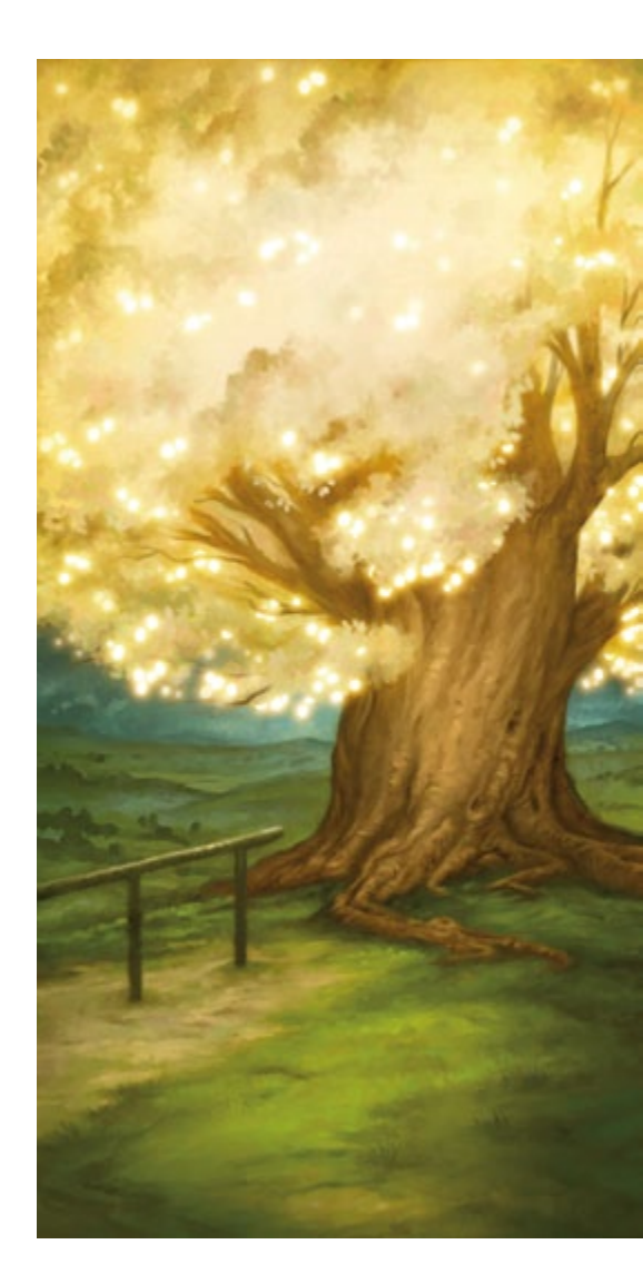
The Book of Mormon teaches principles of obedience that can help us cling to the iron rod as we face decisions.

"As single adults we are also held to the standards in For the Strength of Youth . The law of chastity applies to everyone equally, no matter what your age or situation. I'm grateful for this newfound testimony because it will help me draw closer to the Savior