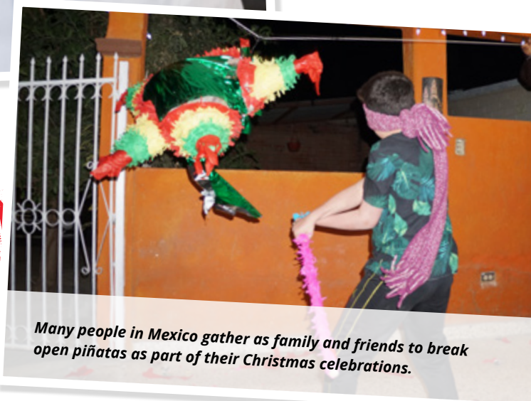
Many people in Mexico gather as family and friends to break open piñatas as part of their Christmas celebrations.

Note: The following youth from Paradise, California, USA, reflect on the meaning of Christmas after the most destructive wildfire in California's history burned down their community.