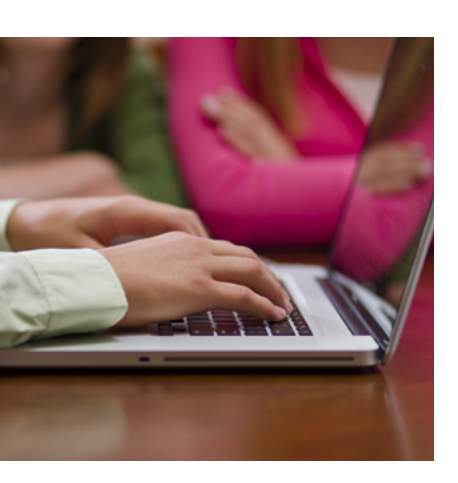
Many of our young people are more familiar with Google than with the gospel, more attuned to the Internet than to inspiration, and more involved with Facebook than with faith.