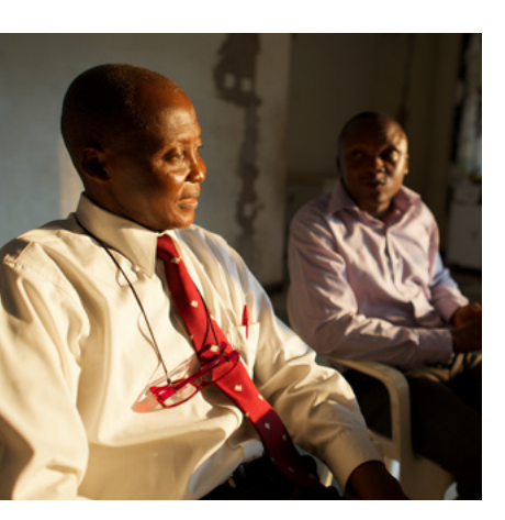
Be courageous by seeking counsel and correction from those you trust: a spouse, priesthood leaders, or supervisors. Ask them where you can improve in your personal discipleship.

Teachers of the gospel today need to accept the opportunity and the responsibility to teach the 21st century's young people correct principles about the plan, including the divinely sanctioned doctrine of marriage and the role of the family as defined in the proclamation on the family.<sup>11</sup>