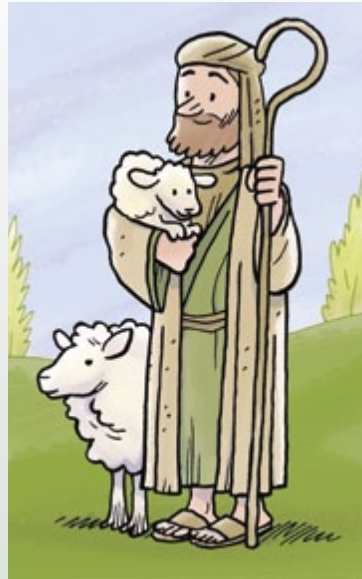
Shepherd (see Psalm 23:1)

Jesus Christ compared Himself to many things. By studying these comparisons, we learn more about Him. Read these scriptures as a family and discuss what these symbols tell us about the Savior.