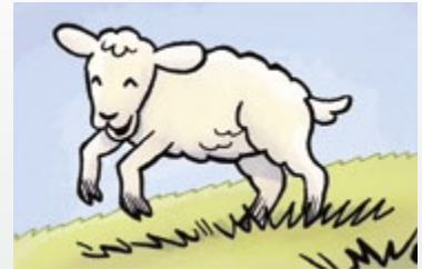
Lamb (see John 1:29)