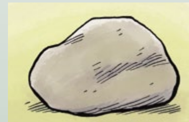
Rock (see 2 Nephi 8:1)