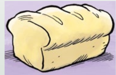
Bread (see John 6:51)