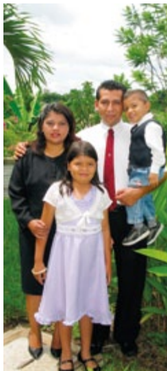
The Vigils were the first family to be sealed in the San Salvador El Salvador Temple, dedicated in August 2011.

The Vigil family will be forever changed through the atoning sacrifice of Jesus Christ and the influence of His temple in their land. Because a plantation has been