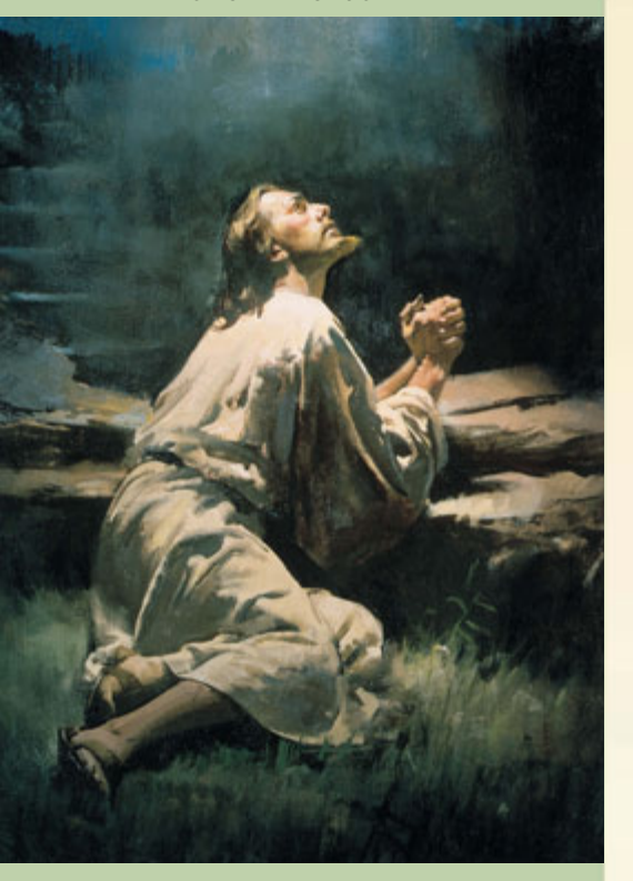
He is the Savior because He really can save us from death and sin and weakness and the ordinary ailments of life.

of good cheer; I have overcome the world" (John 16:33). Accordingly, there is no room for negativism in Christ's Church. Negativism and cynicism stem from Satan. Cheerfulness and optimism stem from Christ.