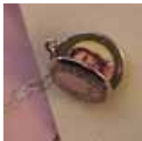
8 The Best Christmas Gifts