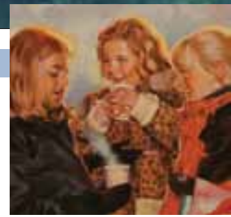
F14 The Hot Chocolate Mishap