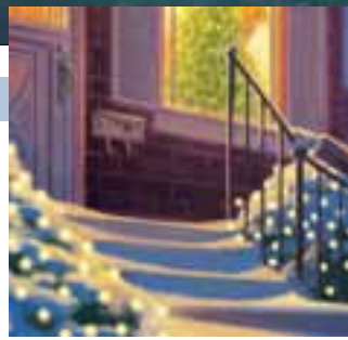
F10 A Christmas Visitor