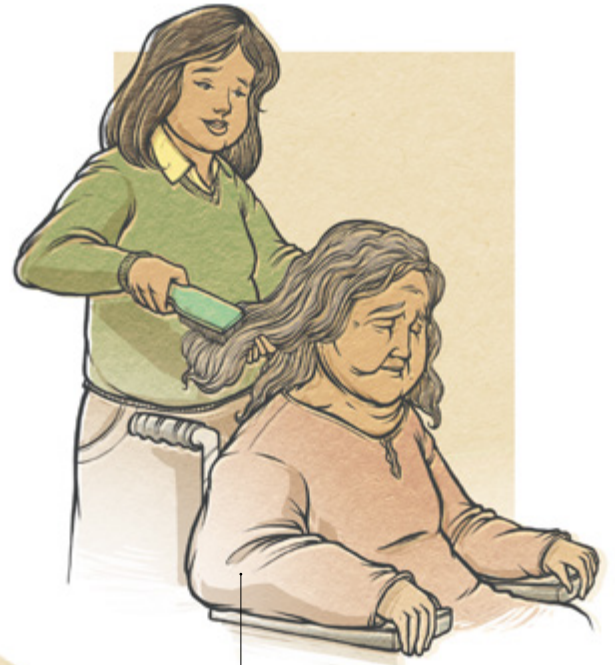
Giving selfless service.