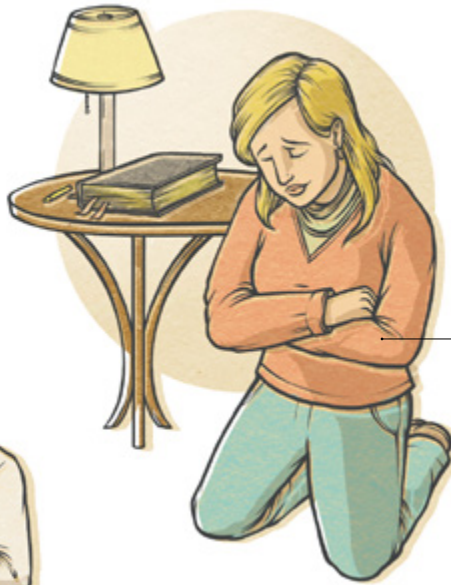
Praying with real intent.