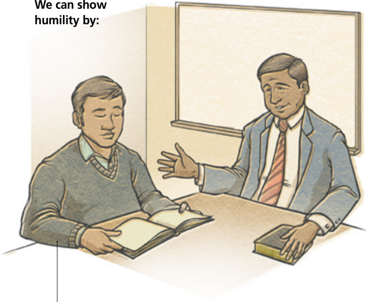
Receiving counsel and correction.