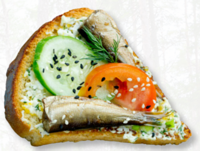
What's for dinner in Estonia? Maybe pork or pickled fish with potatoes, cabbage, sour cream, and black bread. That's called a sprat sandwich.