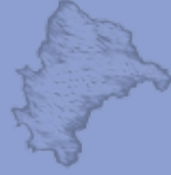
Elder Ulisses Soares Of the Quorum of the Twelve Apostles

Check your answers on lds.org/prophets-and-apostles .