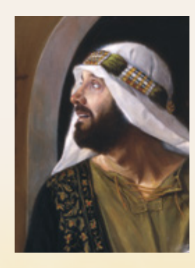
Making Ministering Joyful 8