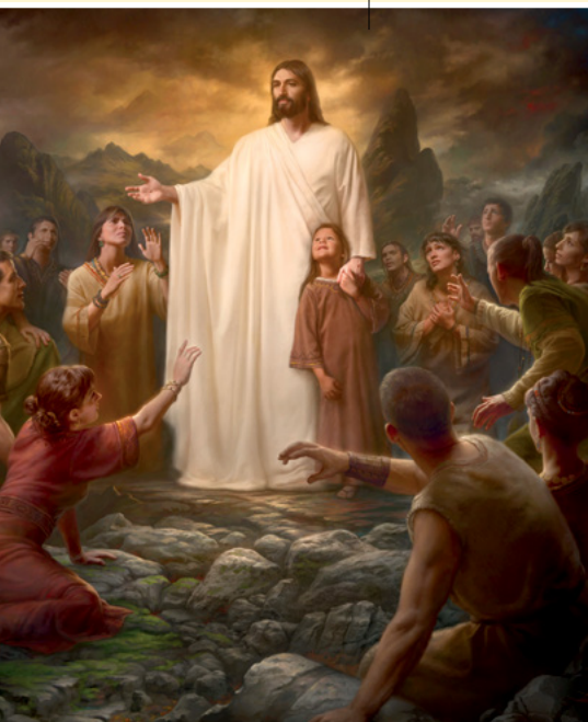
ONE SHEPHERD, BY HOWARD LYON