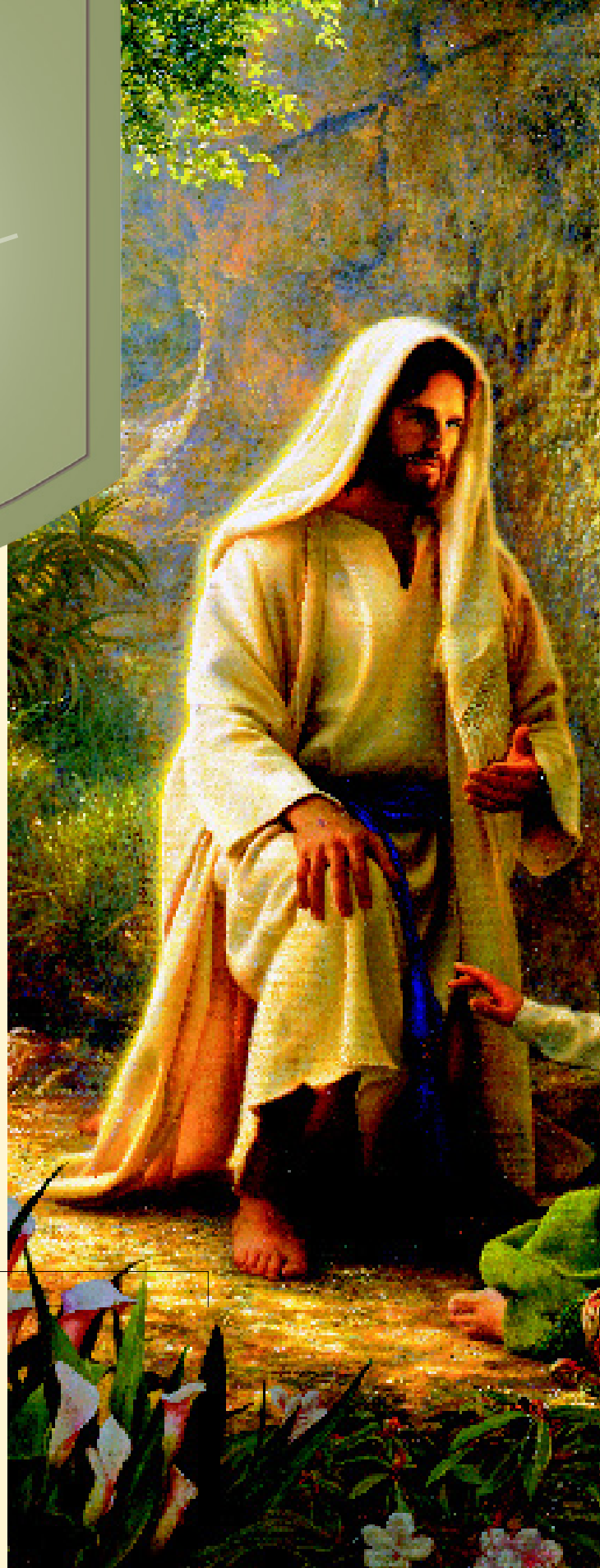
PENNANT

Mary Magdalene was the first witness. The Sunday morning after the Crucifixion, she came to the sepulchre with a few other women to anoint the Lord's body. When Mary discovered an empty tomb, she wept. Someone approached her from behind and asked, "Woman, why weepest thou?" Imagine her surprise when she discovered that it was Jesus, risen from the dead. (See John 20:1-18.)