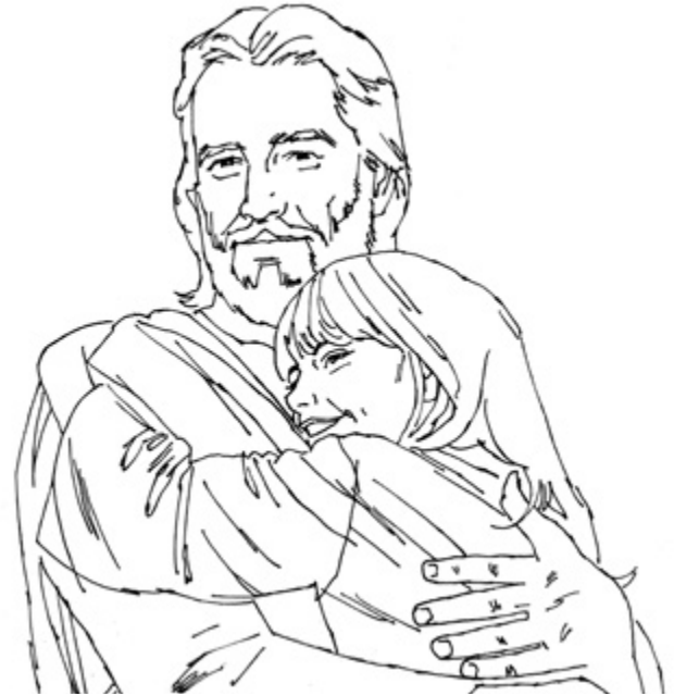
7 My heart I give to Him. I know that my Savior loves me.