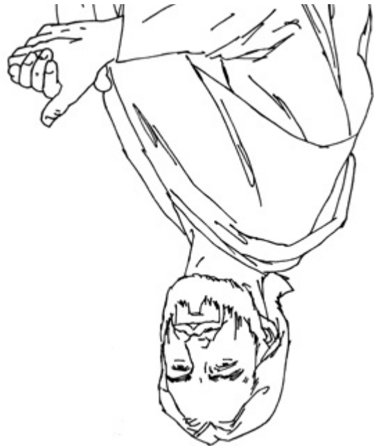
6 I know He lives! I will follow faithfully.