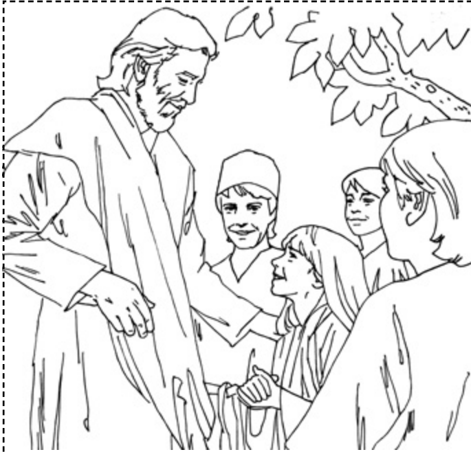
2 A long time ago in a beautiful place, children were gathered 'round Jesus.