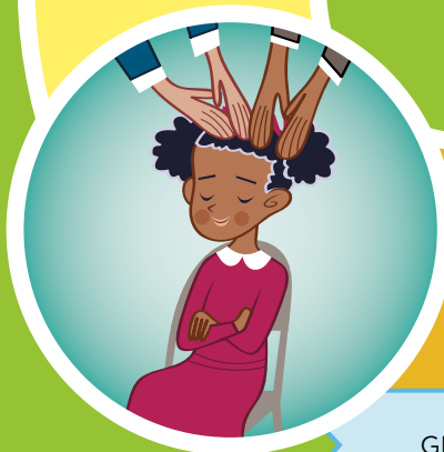
Sacrament— weekly renewal of baptismal covenant

Elder Quentin L. Cook of the Quorum of the Twelve Apostles, "Personal Peace: The Reward of Righteousness," Ensign or Liahona , May 2013, 34.