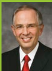
Elder Robert D. Hales of the Quorum of the Twelve Apostles, “Stand Strong in Holy Places,” Ensign or Liahona , May 2013, 49.

“As you worthily participate in the ordinances of the priesthood, the Lord will give you greater strength, peace, and eternal perspective. ”