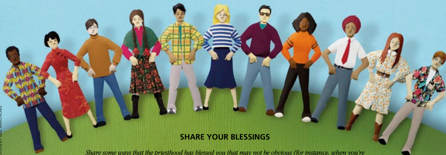
Elder M. Russell Ballard of the Quorum of the Twelve Apostles, “This Is My Work and Glory,” Ensign or Liahona , May 2013, 19.

strengthened by the power of the priesthood. Central to God’s plan for His spirit children is His own declaration: ‘This is my work and my glory—to bring to pass the immortality and eternal life of man’ (Moses 1:39).”