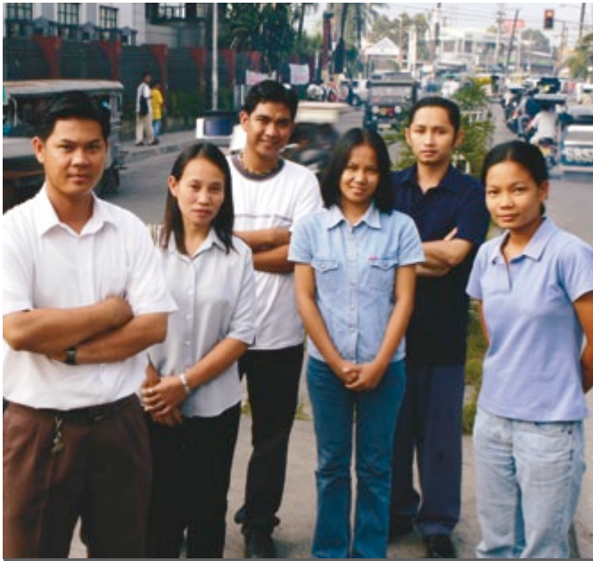
Building on gospel principles, young adults in the Philippines are achieving success and becoming sturdy leaders in the Lord's Church.

servicemen from Utah who had been set apart as missionaries prior to their departure. As opportunities arose, they preached the gospel, but no baptisms followed.