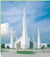
1987: Philippines/Micronesia Area established, with headquarters in Manila