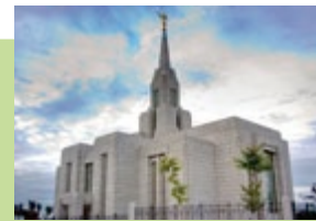
2010: Cebu City Philippines Temple dedicated

A few months after the dedication of the Cebu City Philippines Temple, Filipino Latter-day Saints once again found reason to rejoice. On October 2, 2010, during his opening remarks in general conference, President Thomas S. Monson announced the construction of the Urdaneta Philippines Temple, in Pangasinan.