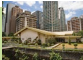
1973: Manila Philippines Stake created