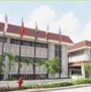
1983: Missionary training center opened in Manila