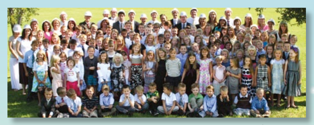
Each week as the Gilbert Arizona Temple is being built, Primary children from the Gilbert Arizona Highland Stake have set a goal to serve someone in their wards.