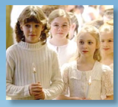
Sometimes temples are rededicated after they are remodeled. Primary children sang and carried lights in the performance that celebrated the rededication of the Anchorage Alaska Temple.