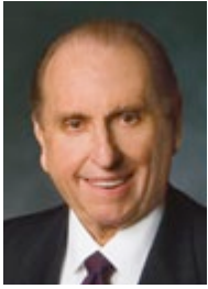
By President Thomas S. Monson