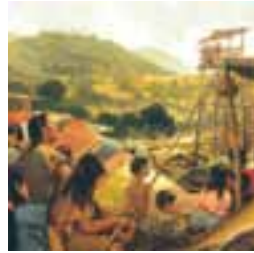
Illustration by Dilleen Marsh.