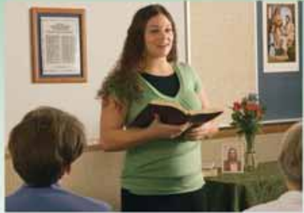
rery member of the Church should be known by and be accountable to a bishop or branch president. This relationship will provide you with opportunities to contribute to the ward or branch where you live.