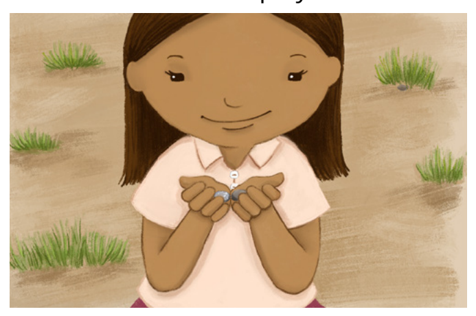
She finds two stones in the grass.