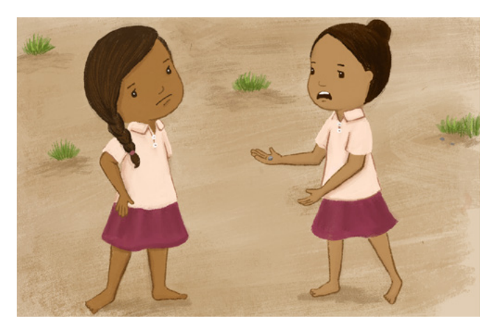
Siya and Ishika only have one stone to play with.