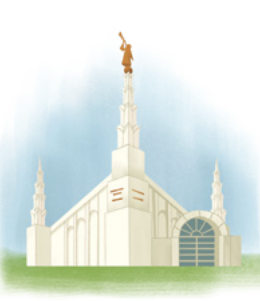
There is also a temple in the capital, Seoul.