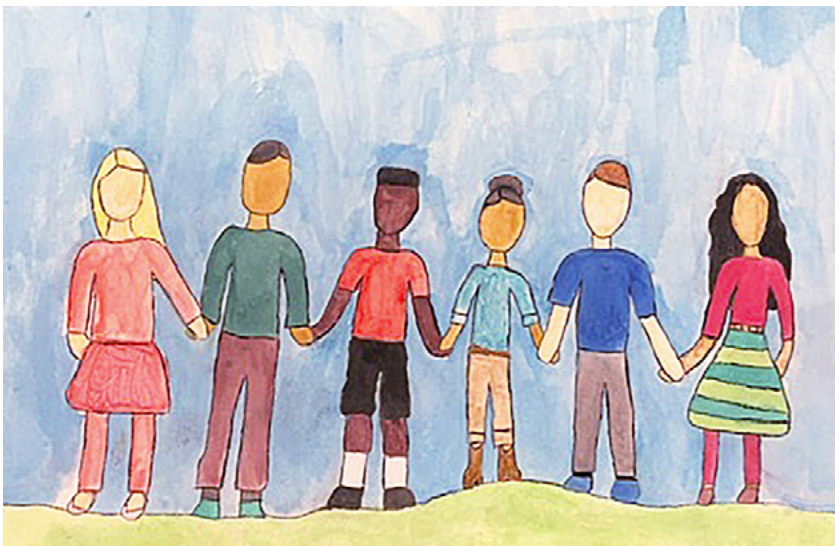
"We All Belong," Madison C., age 10, Utah, USA