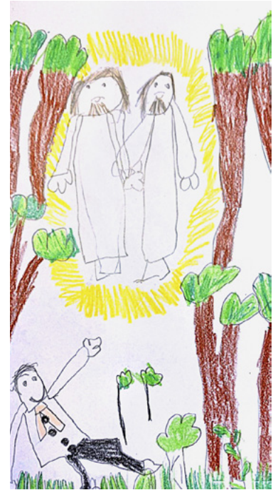
Dallin H., age 6, Auckland, New Zealand