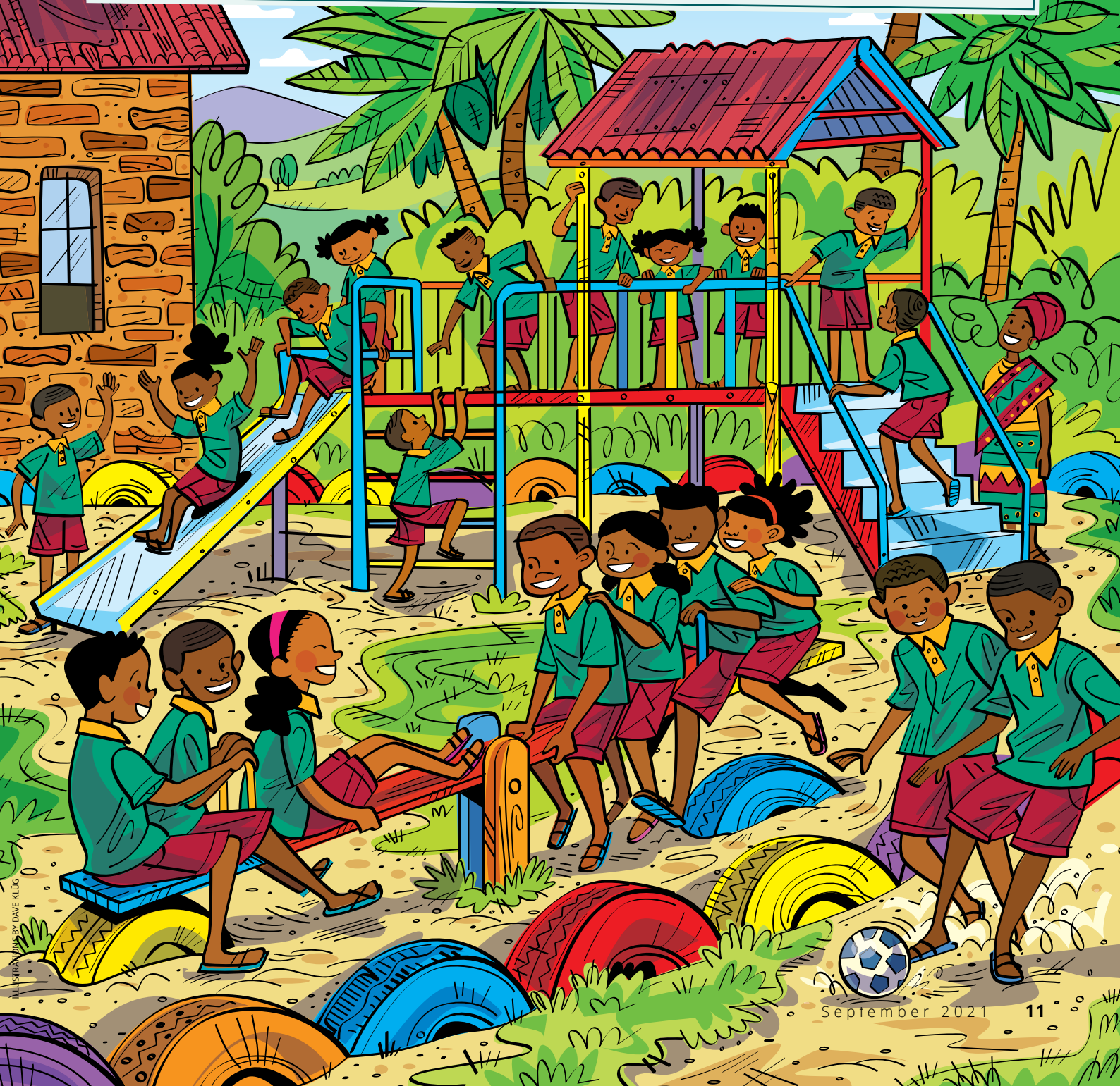
ILLUSTRATION BY DAVE KILG