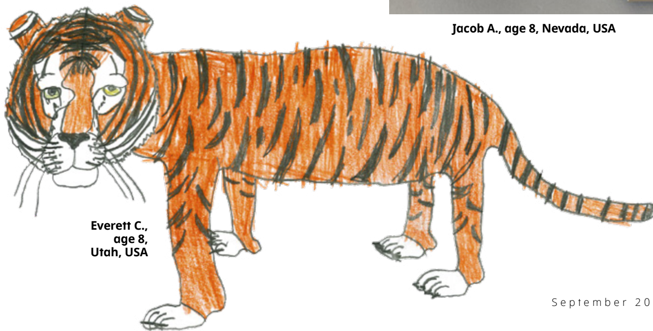
Everett C., age 8, Utah, USA