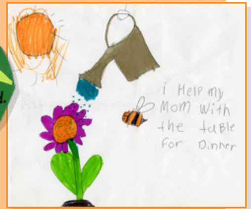
Avery Y., age 6, Washington, USA