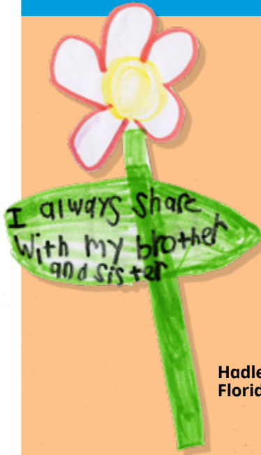
Hadley P., age 6, Florida, USA