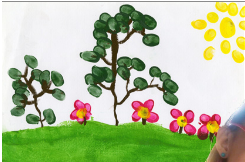
Caeden H., age 11, England