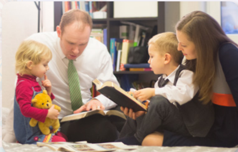
Last year President Nelson announced that a temple will be built in Russia. Members of the Church in Russia were very excited! It will be the first temple in that huge country.