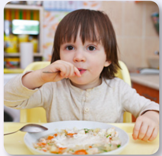
Soup is very popular in Russia! This boy is eating a cabbage soup called shchi .