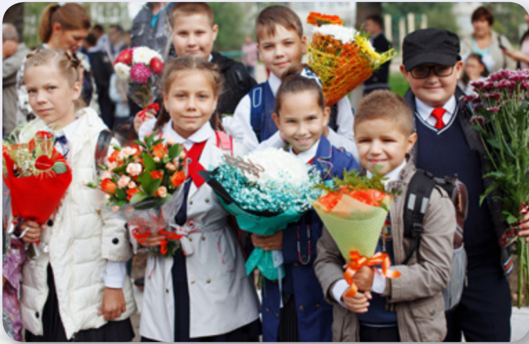
In Russia, the first day of school is called Knowledge Day. Children sing, dance, and bring their teacher flowers.