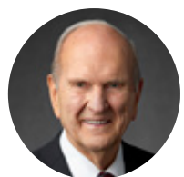
By President Russell M. Nelson