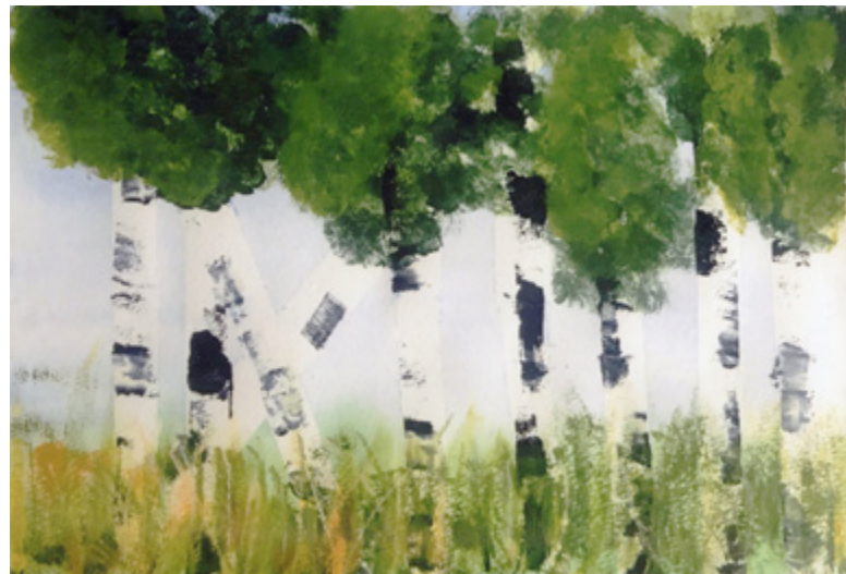
Ariana B., age 9, Utah, USA