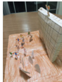
Josiah S., age 7, California, USA

always looks for ways to serve at church. She looks for little children who need comfort or those who may feel alone. She passes out hymnbooks so that everyone can sing.