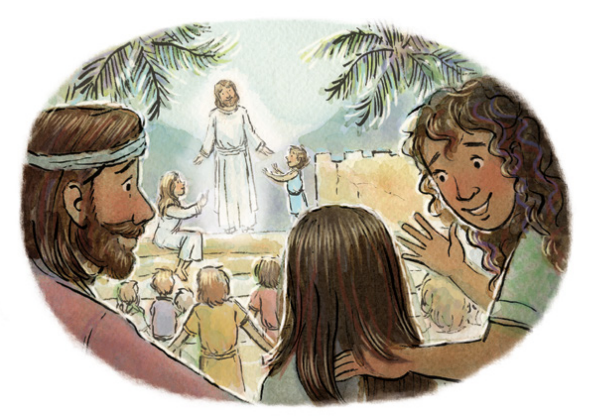
After He was resurrected, Jesus went to visit the Nephites, who lived across the ocean.

He called 12 disciples and gave them the priesthood. He healed people who were sick or hurt. He taught people how to pray. Everyone bowed down and worshipped Him.