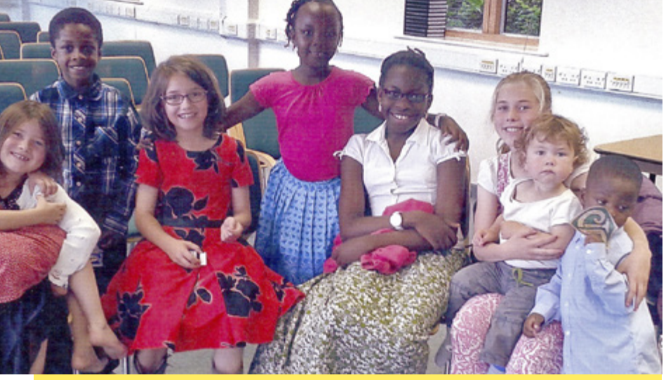
Primary children from the Aberystwyth Branch, Merthyr Tydfil Wales Stake, enjoy meeting together on Sundays and for Primary activities.

Send us your footprints! See how on page 39.