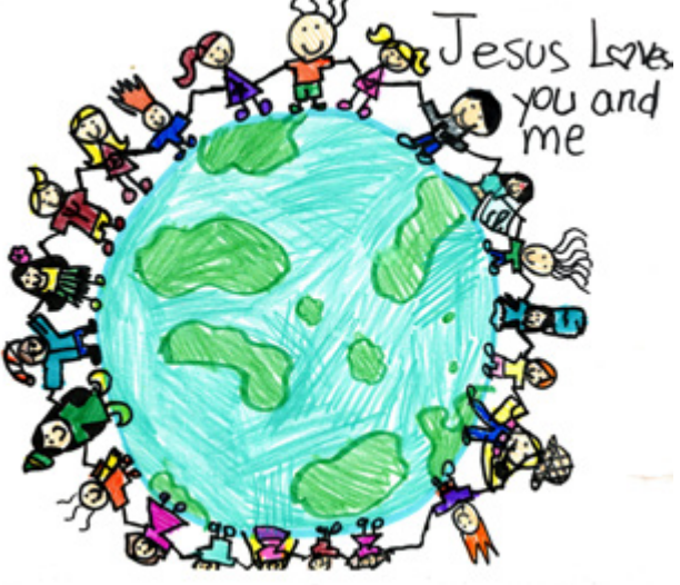
Abigail W., age 8, Arizona, USA