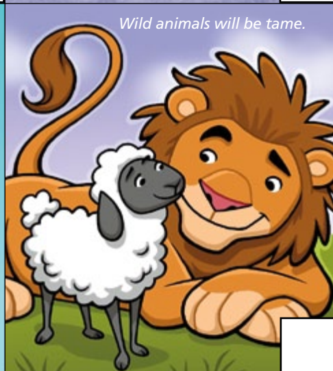
Wild animals will be tame.