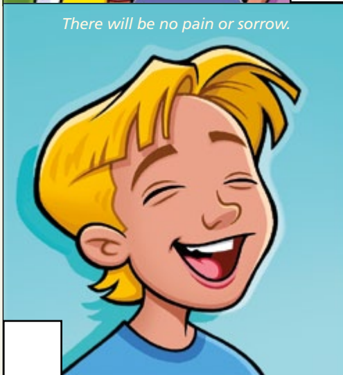
There will be no pain or sorrow.