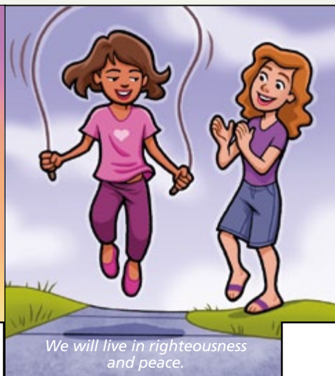
We will live in righteousness and peace.