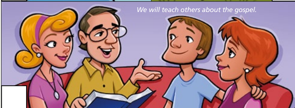
We will teach others about the gospel.