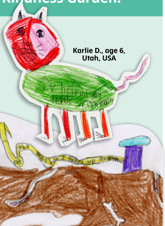
Karlie D., age 6, Utah, USA