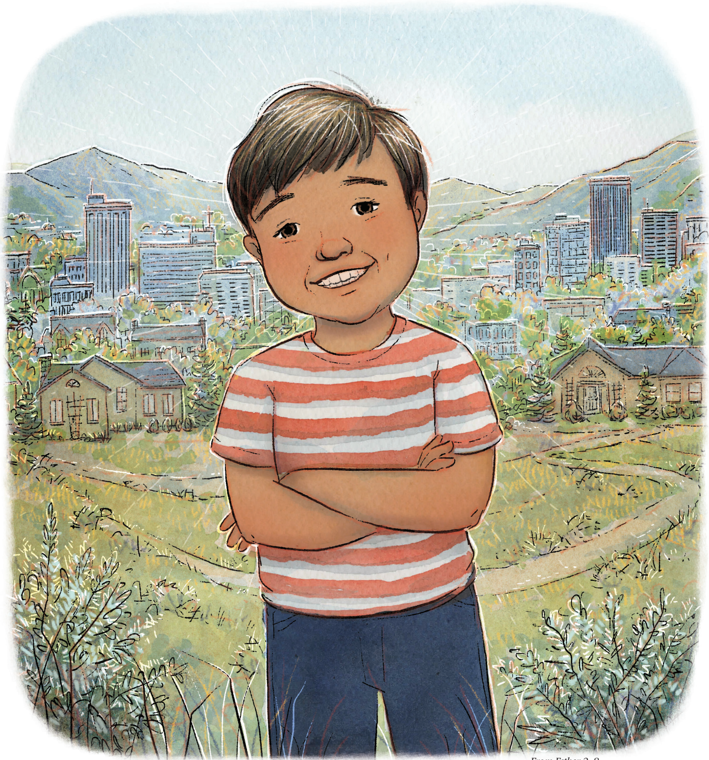
From Esther 2-8.

We can pray to ask Heavenly Father for help. We can be brave and courageous, like Esther. ●