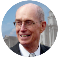
By President Henry B. Eyring Second Counselor in the First Presidency