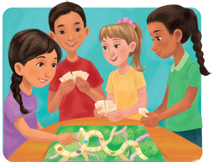
Adapted from "Our Hearts Knit as One," Ensign, Nov. 2008, 68–71.