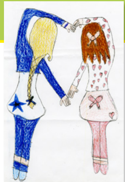
Paige O., age 10, Connecticut, USA