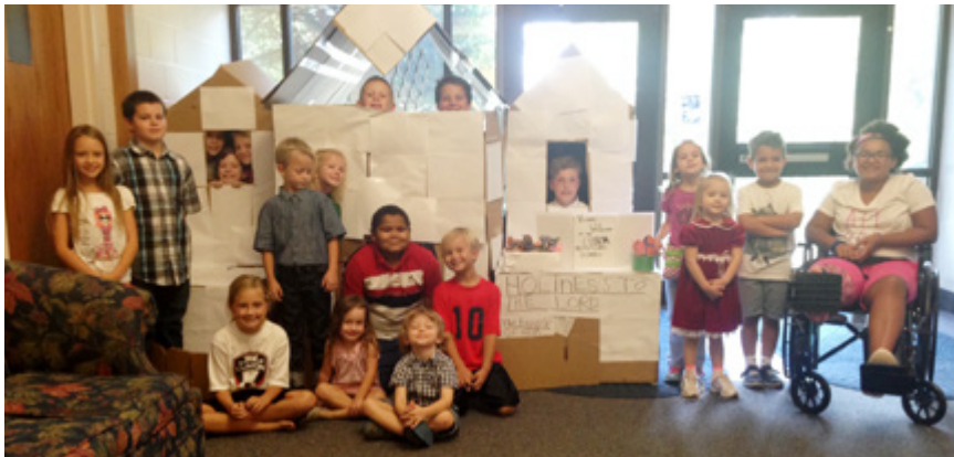
Primary children in the Jackson Mississippi Stake, Mississippi, USA , built cardboard box temples for their stake family history day. As they built their own temples, they talked about what it would be like to build a real temple.