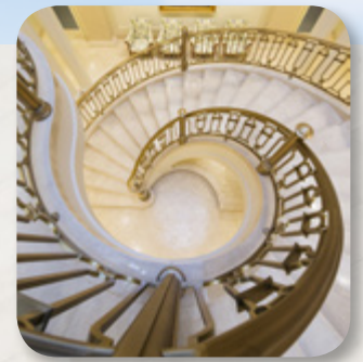
The spiral staircase in the Paris France Temple